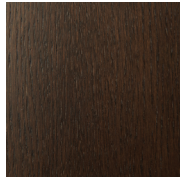
DARK SMOKED OAK